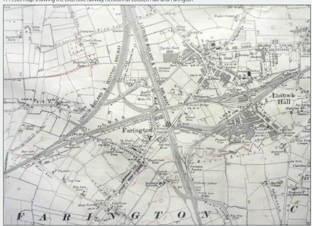
A 1930s map showing the extensive railway network at Lostock Hall and Farington