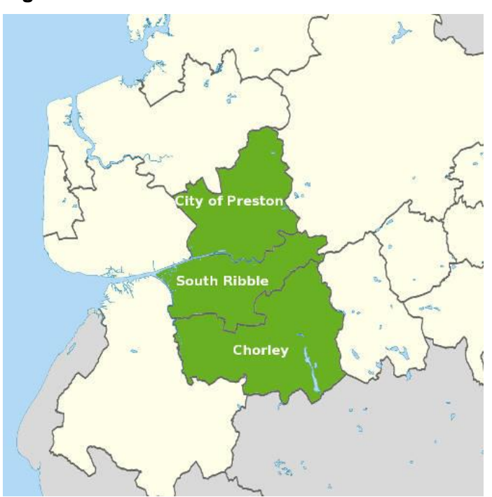
Figure 1 - Central Lancashire

1.1 This Key Issues Report provides a synopsis of the key findings of the Employment Land Study for the Central Lancashire sub-region of Chorley, Preston and South Ribble (see Figure 1). It was carried out by BE Group on behalf of Chorley and South Ribble Borough Councils, as well as Preston City Council.